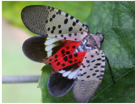
Spotted lanternfly adult.