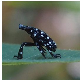
Spotted lanternfly early instar nymph.