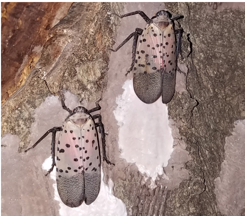
Spotted lanternfly adults and egg masses.