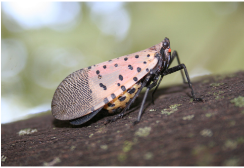
Spotted lanternfly adult.